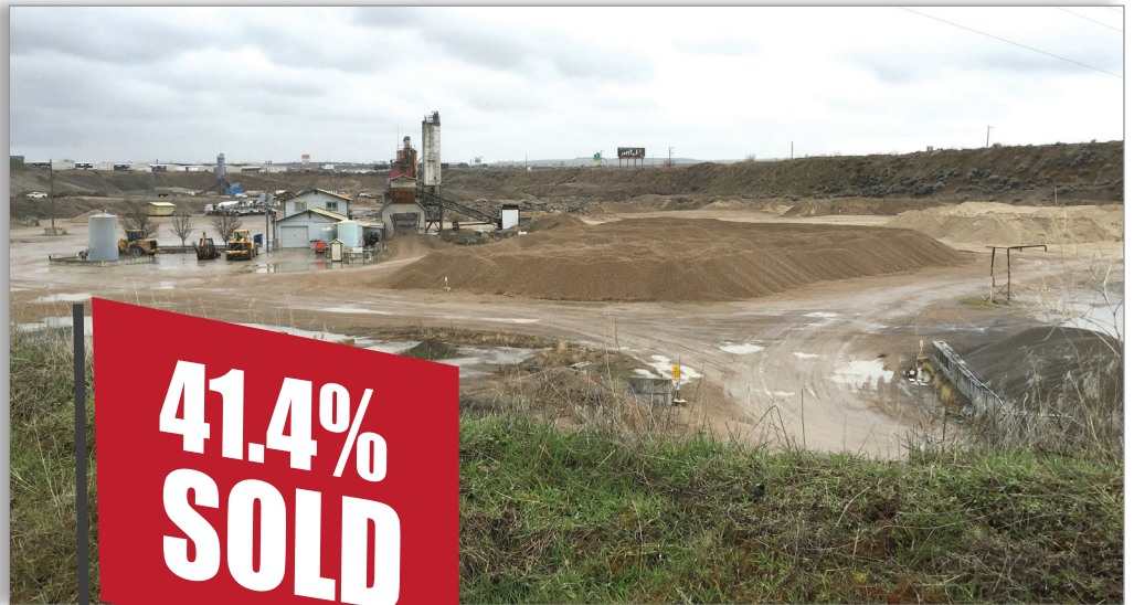
Former state land parcel that is now privately owned.

Access to more than 1.7 million acres of state land has been lost forever after these lands were liquidated to corporations and other private interests — an area approaching the size of the Sawtooth National Forest.